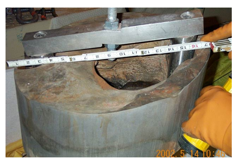
In 2002, corrosion of the vessel head at the Davis-Besse nuclear power plant in Ohio could have led to the loss of coolant from the reactor core and a meltdown. The incident is considered to be the most serious in the United States since Three Mile Island.

Nuclear plants contain thousands of critical parts. Inevitably, some of those parts fail and need to