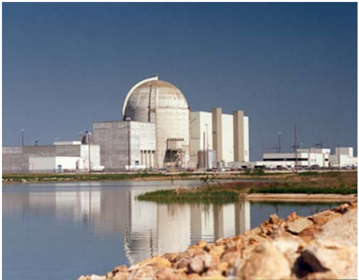
In 1994, coolant was accidentally drained from the reactor at the Wolf Creek nuclear power plant in Kansas. Had workers not stopped the outflow in time, the fuel rods in the reactor core could have quickly become exposed, leading to the potential for a meltdown.

In March 2011, the Union of Concerned Scientists released an illuminating report documenting